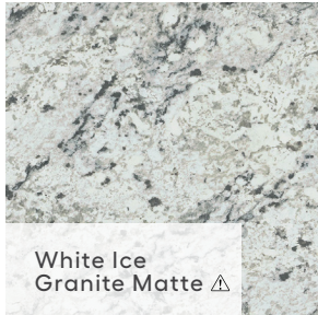
White Ice Granite Matte ▲

This color is available in addition to the standard stock options.