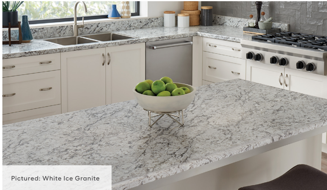
Pictured: White Ice Granite